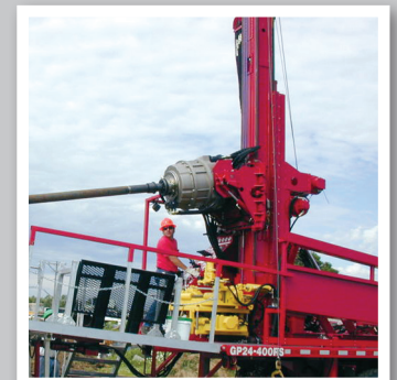
Tilt out carriage for all types of Sonic heads

Tandem axle truck, trailer, skid, or track mounted • Customizing obtainable