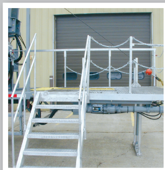
Aluminum Work Platform